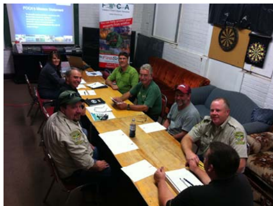
Members of the SCOFCC meet with FOCA