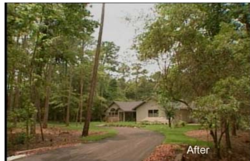
Before and after photos demonstrating FireSmart principles